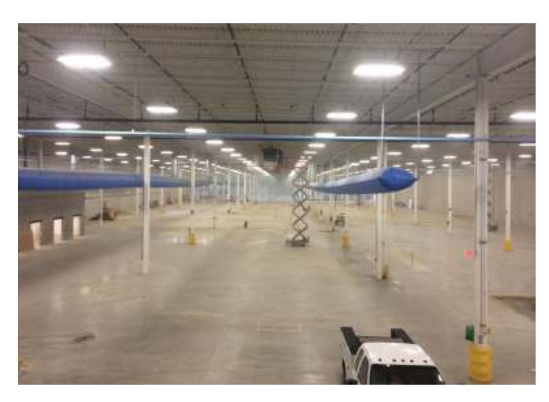
February 25, 2014